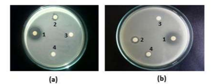
Fig. 2. Antibacterial bioassay of Gliocladium sp. T.N.C73 fermentation medium extracts against (a) B. subtilis; and (b) E. carotovora subsp. carotovora, by the disc diffusion method after incubation at 37^{\circ} C for 24 hours. Disc 1: Extract A. Disc 2: Extract B. Disc 3: Negative controls of MeOH. Disc 4: Amoxicillin

Extract A and extract B were tested for their ability to inhibit growth of E. carotovora subsp. carotovora , as a plant pathogen and Gram negative bacteria, and compared to its ability to inhibit B. subtilis representing Gram positive bacteria. As shown in Table 1 and Fig. 2, extract A and B could inhibit growth of E. carotovora subsp. carotovora . Extract A gave significantly higher inhibition zones (p < 0.05) than extract B and Amoxicillin, to both bioassays against E. carotovora subsp. carotovora and B subtilis . Extract B gave significantly higher inhibition zones toward B. subtilis (p < 0.05), than toward E. carotovora subsp. carotovora , but had the same inhibition zone as the positive control Amoxicillin toward B. subtilis . No inhibition zones were detected in the negative controls.